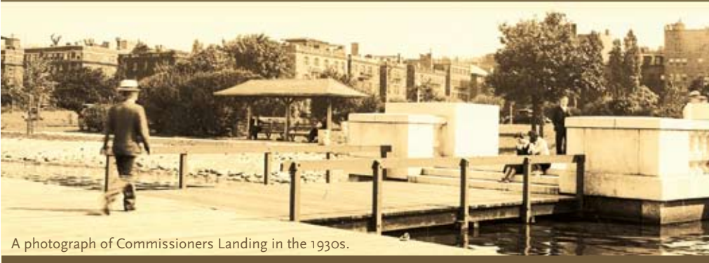
A photograph of Commissioners Landing in the 1930s.